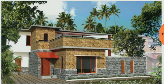
TYPE 2A Plot area: 2994 sq. ft. Ground floor: 1502 sq. ft. First floor: 1118 sq. ft. Total built area: 2546 sq. ft.