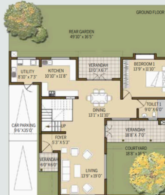
TYPE 2A Plot area: 2994 sq. ft. Ground floor: 1502 sq. ft. First floor: 1118 sq. ft. Total built area: 2546 sq. ft.