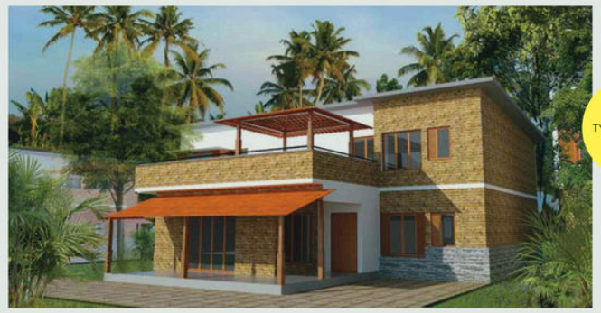
TYPE 1E Plot area: 4009 sq. ft. Ground floor: 2076 sq. ft. First floor: 1649 sq. ft. Total built area: 3725 sq. ft.