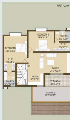
TYPE 1A Plot area: 2758 sq. ft. Ground floor: 1537 sq. ft. First floor: 1301 sq. ft. Total built area: 2837 sq. ft.