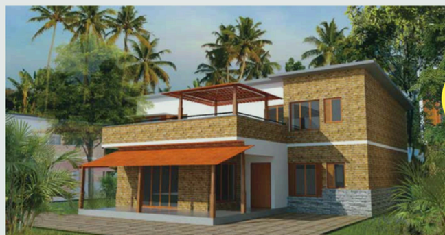
TYPE 1E Plot area: 4009 sq. ft. Ground floor: 2076 sq. ft. First floor: 1649 sq. ft. Total built area: 3725 sq. ft.

Cleverly designed spaces with minimal walls or no walls at all seem to flow seamlessly from the entrance verandah, through the living and dining areas to the rear verandah and into the rear garden. This creates a sense of spaciousness in an otherwise compact plan and the beauty of the outdoors can be appreciated from various points within the home. The position of the plot in the layout and proximity to the parks will decide the emphasis on the front or rear garden.